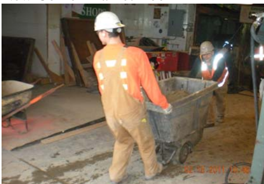
Carting away debris from Corner Market