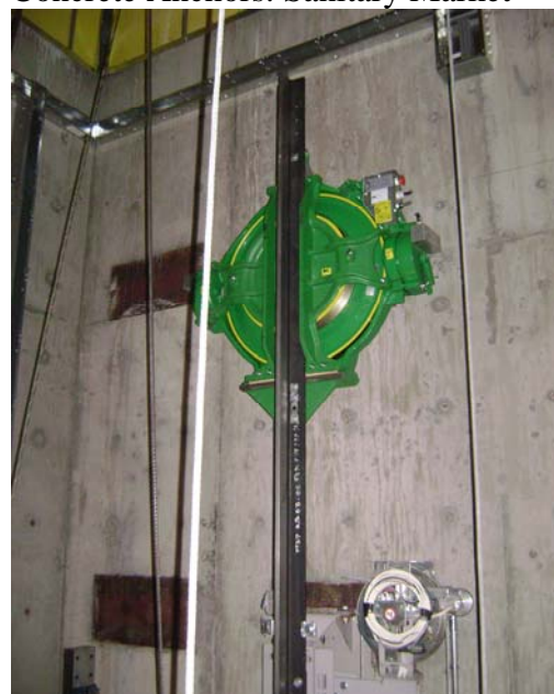
Elevator rails & Equipment Installation