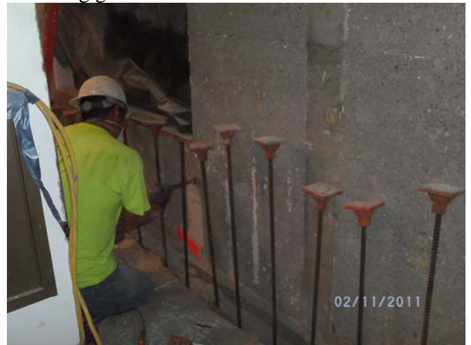
Concrete Anchors: Sanitary Market