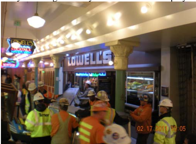
Moving back the Pure Food Fish Display Case