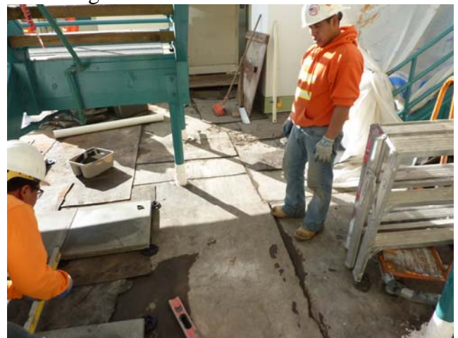
Paver Install on the Sanitary Deck