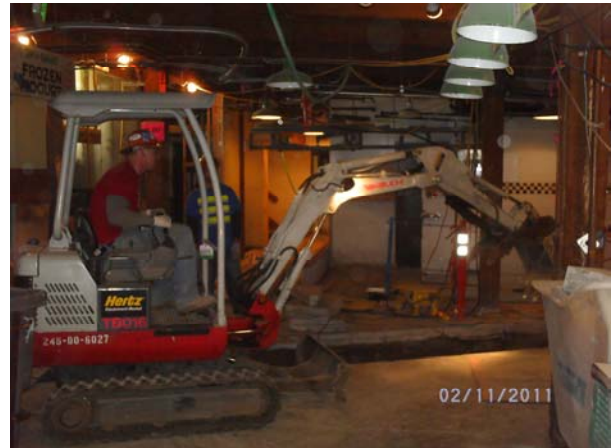
Trenching in the Corner Market