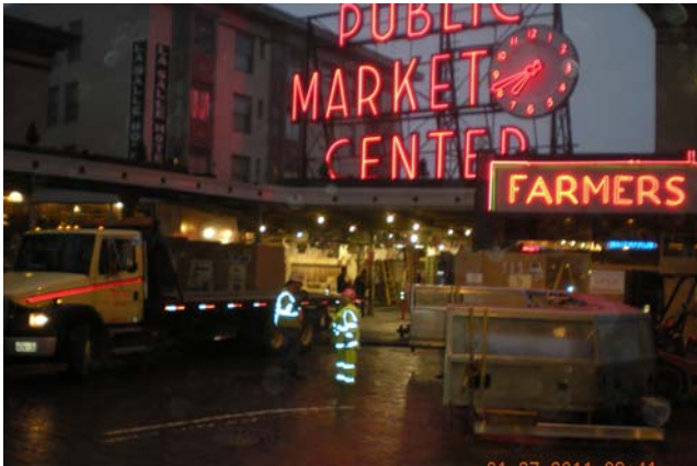
Early Morning Delivery Pike Place Fish Display