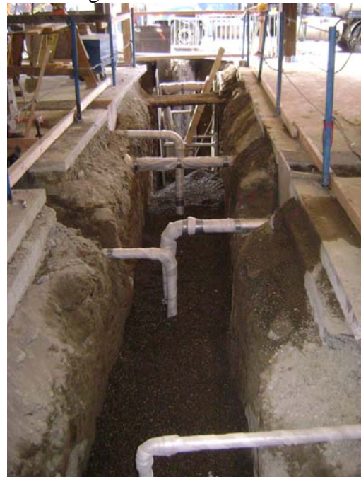
Underground Plumbing - Corner Market