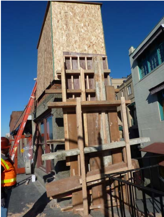
Triangle Deck Point Modifications