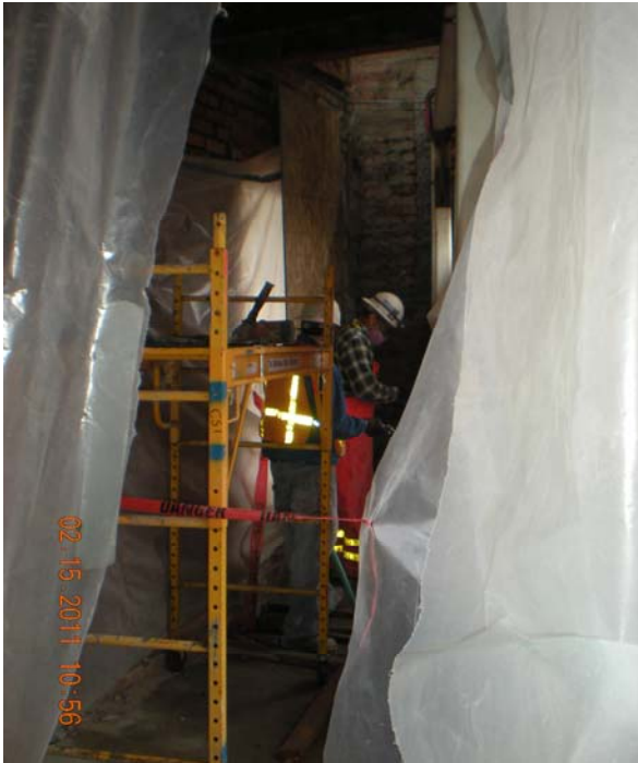
South Point Copacabana Shearwall prep