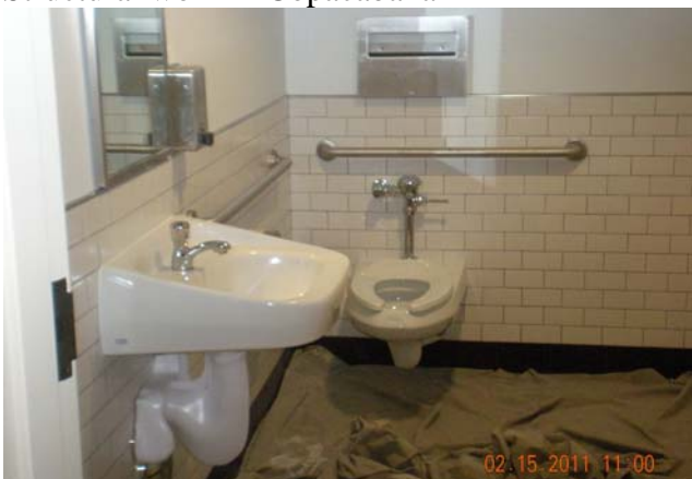
Triangle Basement Bathrooms: Pre-punch