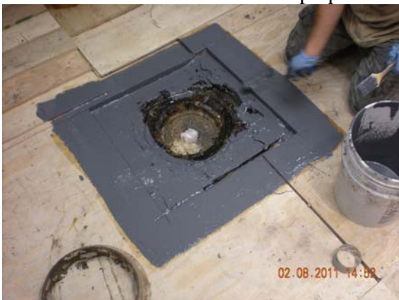
Sealing the drain at Pure Food Fish Floor