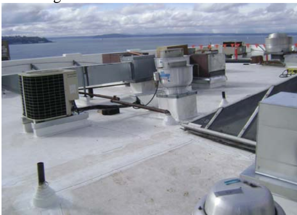
New Corner Market Roof