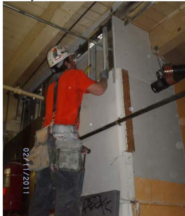
Drywall patching around Oscar Brace Frame