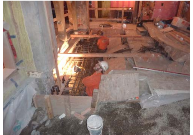
Winston Churchill Footing Prep