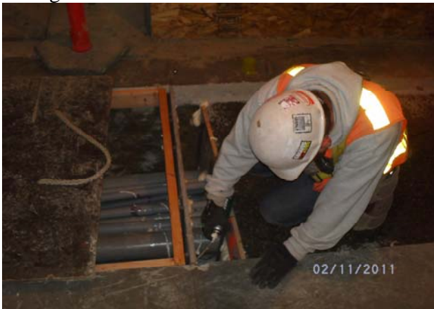
Corner Market Trench – backfill prep