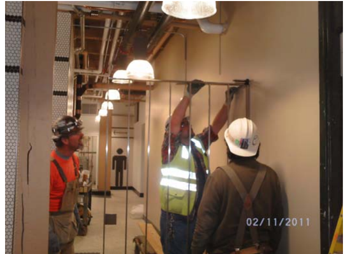
Installing gate outside 602 Restrooms