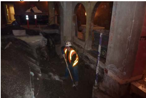
Grade Beam Prep - Can Can