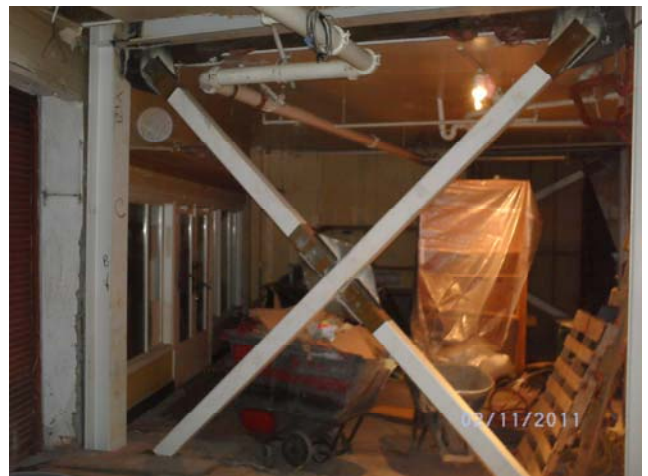
Lahma Brace Frame – Triangle L6