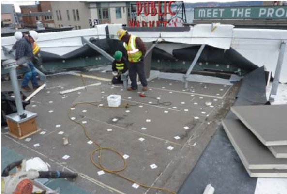
Finishing the Corner Market Roof