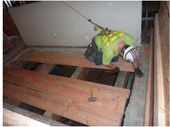
Sanitary Market basement access build back