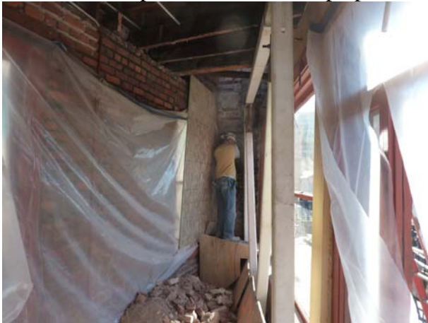
Structural work in Copacabana