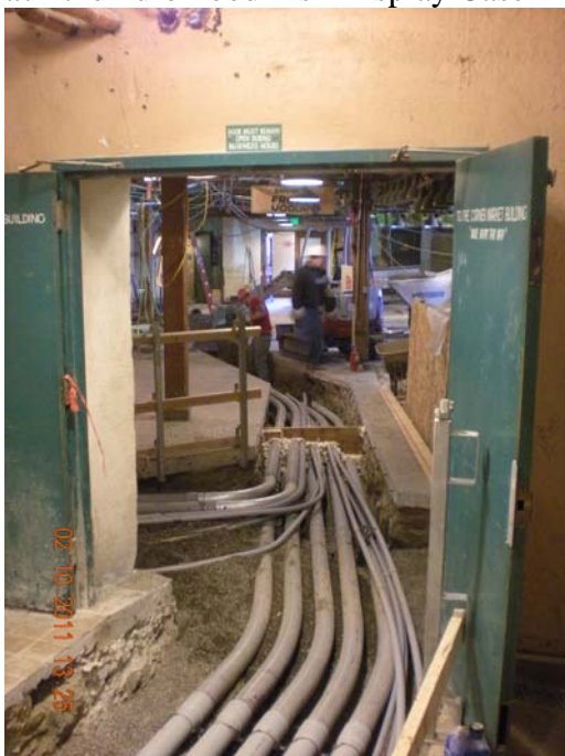
Conduits in the main common trench