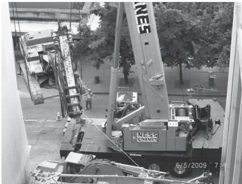
A crane that can lift 550 tons—only two this large exist on the West Coast!—was brought in to lift the Lodril (seen in the upper left) into place.

By the start of June, the largest rig had been lifted off the site in early morning hours and a new set of smaller equipment